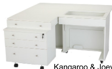
Kangaroo & Joey