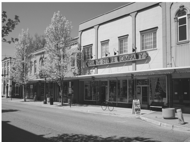
KEAN'S STORE COMPANY IN DOWNTOWN MASON

Come browse our selection of patterns, sewing notions, crafting supplies, oilcloth, DMC floss, and much more.